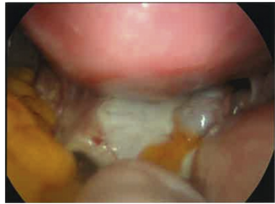
Fig. 3. Bilateral ovaries fused together in the posterior cul-de-sac.

ovarian damage or necrosis, further dissection was felt not to be appropriate or safe.