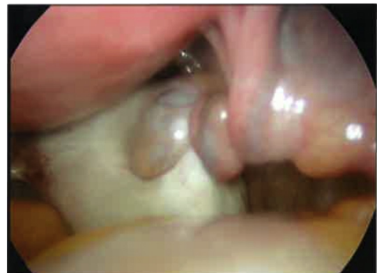
Fig. 4. Right ovary with torsion of infundibulopelvic ligament.

There are three clinical take-home points from the current case. First, although torsion is most commonly associated with an adnexal mass or lesion on the ovary, there are unique conditions in which torsion should not be forgotten: ovarian hyperstimulation following fertility treatment and polycystic ovarian syndrome. Polycystic ovaries have been implicated in up to 7% of patients with torsion [6]. PCOS also