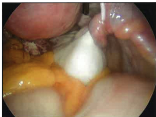
Fig. 5. Right ovarian torsion after separation of fused ovaries.

represents a potentially non-modifiable risk of recurrent torsion. In one case report, a 28-year-old with PCOS experienced unilateral ovarian torsion seven times in an eight-year period [3].