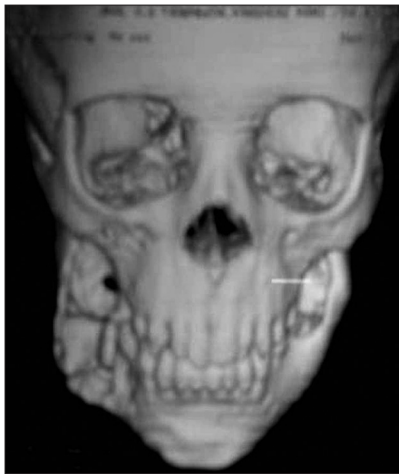
Figure 3: Pre-operative computerized tomography