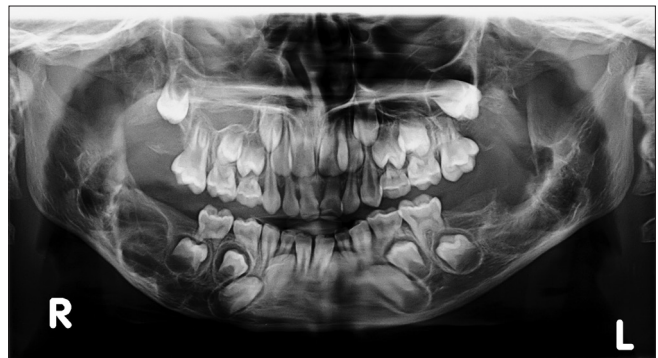
Figure 6: Follow-up orthopantomogram

that delivers immediate results and arrest the growth of any remaining cherubic tissue. [10] Attempts to control this disease with radiotherapy have to be rejected completely. Osteosarcoma in the irradiated area is a possibility. [13]