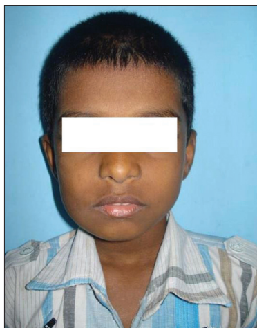
Figure 5: Follow-up picture