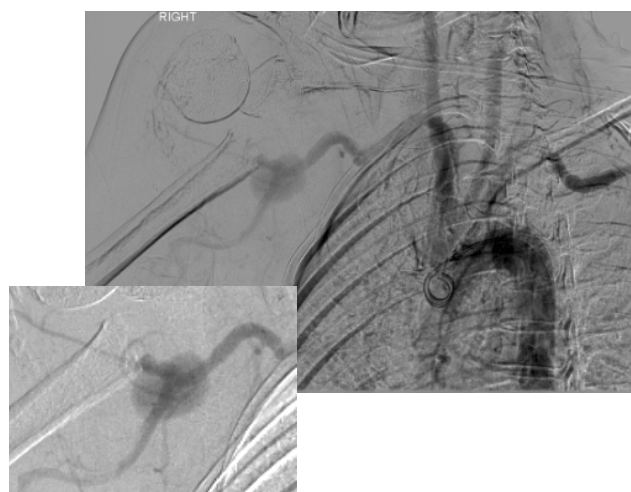
Figure 2 Catheter angiogram depicting pseudoaneurysm formation of third part of axillary artery with complete occlusion of the distal right brachial artery.

Operative treatment was undertaken with initial exposure and control of the subclavian artery above the clavicle (Fig. 3A). Simultaneous exposure of the brachial artery in the antecubital fossa was performed and a size 3 Fogarty embolectomy catheter passed distally down the brachial artery. Both radial and ulnar arteries were found to contain thrombus which was cleared with good back flow. The proximal brachial and distal subclavian arteries were ligated in continuity. Two interconnected Javid™ shunts were inserted to carry blood flow from the subclavian to the brachial artery in order to maintain perfusion (Fig. 3B) during open reduction and internal fixation of the fractured humerus, after which a subclavian to brachial bypass was performed using reversed long saphenous vein. The fracture was temporarily stabilised using external splints to immobilize the limb whilst securing vascular continuity.