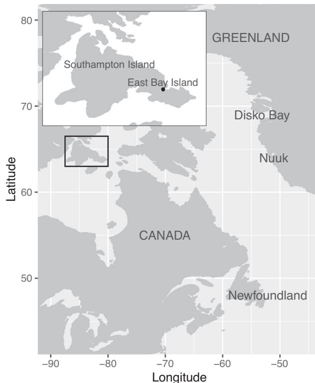
FIGURE 1 Location of common eider breeding colony on East Bay Island, Nunavut, Canada, and wintering sites at Disko Bay and Nuuk, Greenland, and Newfoundland, Canada

Female common eiders were captured during the pre-breeding period (mid-June to early July) from 2014 to 2017 using large flight nets ( n = 273 individuals). Birds were banded with field-readable alpha-numeric plastic bands as well as a metal band from the USGS Bird Banding Laboratory. Each female was also given a combination of uniquely colored and shaped plastic nasal tags threaded through their nares with UV degradable monofilament. This enabled us to identify and monitor individual hens on the colony in June and July, but ensured