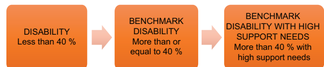
Figure 1: Continuum of disability as discussed in the RPwD 2016

This definition is the same as that provided by the Mental Health Care Act 2017 (MHCA) [6] and reflects a progressive move. It may be argued that the use of the term “substantial” may lend itself to varying interpretations again, due to the lack of