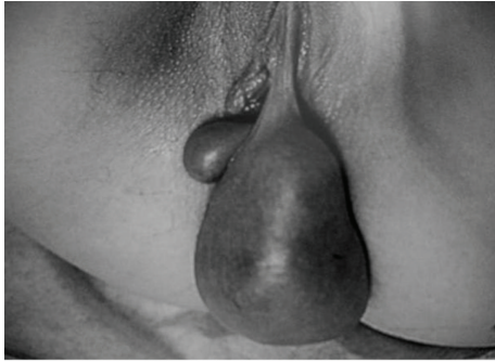
FIGURE 1: The tumor shows a pedunculated large mass arising from the labia minora with a subtle stalk.

tumor with homogeneous echo and normal vascularity. In order to exclude a surgical disease, such as perineal hernia [11–13], the patient was evaluated by surgeons that, according with personal history, clinical examination, and ultrasonography, excluded a lesion of their interest.