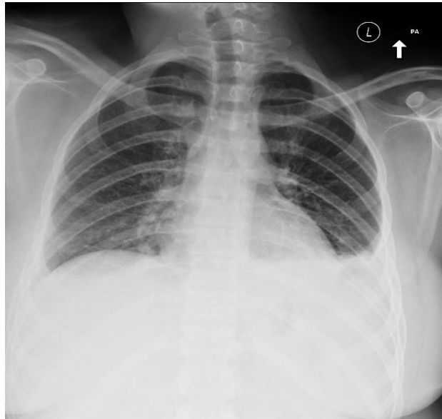
Figure 1. Chest film showing no infiltrates, and no hilar adenopathy with small left sided pleural effusion.

Because of fever, sore throat and dyspnea, oropharyngeal swab for respiratory panel PCR Film Array (Genexpert, Paris, France) was done and was negative for influenza, respiratory viruses and Mycoplasma pneumoniae . Her complete blood count (CBC) was unremarkable except marked atypical lymphocytosis 21% ( n < 5\% ). Routine laboratory tests were also unremarkable except for mildly elevated serum transaminases. The MonoSpot test was positive. Chest X-ray (CXR) showed no infiltrates and a small left pleural effusion (Figure 1). Chest computed tomography (CT) scan revealed multiple bilateral lower-lobe infiltrates and splenomegaly (15.2 cm \times 17.1 cm) (Figure 2). Her EBV VCA IgM titer was 72.8 U/mL ( n \leq 36 U/mL), and her EBV VCA IgG titer was 402 U/mL ( n \leq 18 U/mL).