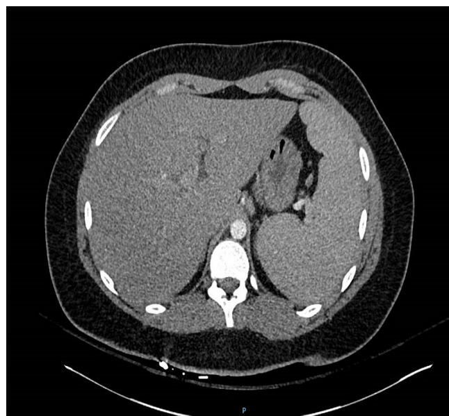
Figure 2. Chest computed tomography (CT) scan showing marked splenomegaly.