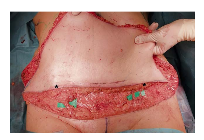
Fig. 2. The abdominal skin is harvested, and the subcutaneous arteries coming from the femoral regions are identified. According to the literature, these could be called either SIEA or SCIA-SB. If the exact origin of these vessels is not determined, the term "subcutaneous artery of the abdomen" can be used. The asterisks indicate the location of the anterior superior iliac spines.