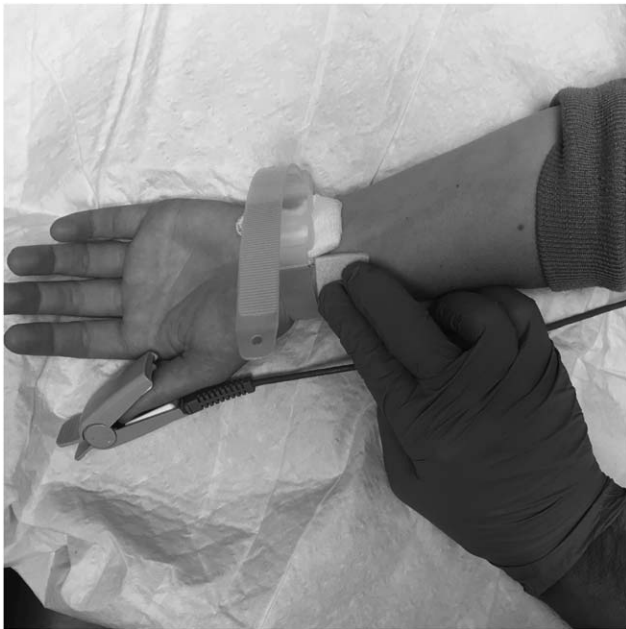
FIGURE 1 Radial artery access site after sheath removal using hemoband over ulnar artery and SoftSeal-STF pad over radial artery with manual compression with photoplethysmogram to confirm patent hemostasis