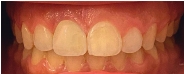
FIGURE 4: Final photograph after cementation.