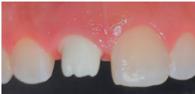
FIGURE 2: Zirconia custom abutment (final) try-in in the patient's mouth.

abutments cementation to the crown (Figure 3). The final cemented screw-retained crown was tried in the patient's mouth and then torqued to 30 Ncm. A sterilized piece of Teflon tape was placed in the screw access hole above the screw head and then the access hole was closed by composite resin (Filtek™ Z350 XT Universal, 3M ESPE, Seefeld, Germany), occlusion was rechecked again, and final finishing and polishing were done to composite restoration. Follow-up was done after 3, 6, and 12 months' intervals. The implant restoration was successful with no complaints from the patient and was esthetically pleasing (Figure 4).