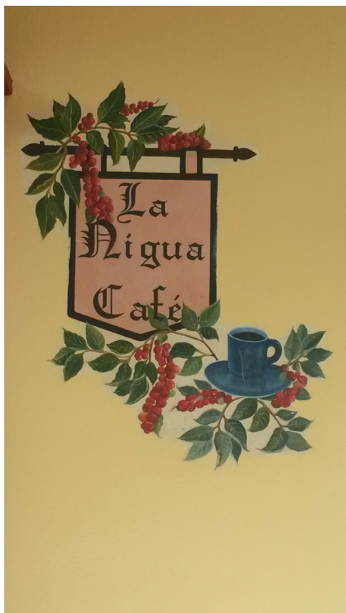
Fig. 1 – Name plate of a coffee shop in Popayan, Southwest Colombia, reflecting that tungiasis was common in the town. Nigua is a popular name in Spanish for the sand flea.

Data on geographical disease occurrence in the Americas is scanty, but indicate that tungiasis exists in Mexico, Honduras, 2 Venezuela, Colombia, 3 Ecuador, Peru, Paraguay, Argentina, Haiti, Barbados, and Trinidad. 3,4 In Brazil tungiasis is reported from Amazonia State in the North to Rio Grande do Sul State in the South. 5 Several community-based studies performed in Brazil, Haiti and Trinidad-Tobago showed astoundingly high prevalence in resource-poor rural and urban communities.