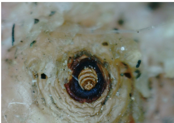
Fig. 4 – Pigdial area and respiratory spiracles of Tungia Penetrans .

but is considerably less than 20 \mu\text{m} . Only fluids with no surface tension can penetrate into such small openings.