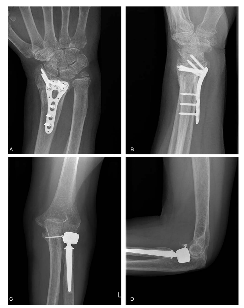
Figure 2. Postoperative plain radiographs of the wrist (A, B) and the elbow (C, D) of case 1 show that open reduction and internal fixation was performed for the distal radius and coronoid process fractures, and radial head replacement for the radial head fracture.

reduction and internal fixation (ORIF) with a volar approach using a 2.4 mm Variable Angle Locking Compression Plate Distal Radius system (VA-LCP, Synthes, West Chester, PA). For the radial head fracture, radial head replacement arthroplasty (Tornier SA. Saint-Ismier, France) was performed because of the patient's age and severely comminuted fragments. The coronoid process fracture was fixed with a 3.5 mm cortical screw through the lateral approach (Fig. 2). Postoperative immobilization was applied, and an above-elbow splint was used for 2 weeks, after which a short arm splint was applied until postoperative 4 weeks. Elbow motion was allowed after postoperative 2 weeks, and wrist motion was allowed after postoperative 4 weeks. The bony union of the distal radius was visualized on x-ray at postoperative 6 weeks. The patient was followed for 13 months, at which her wrist showed 45 degrees of flexion and extension, full supination, and pronation. Her elbow