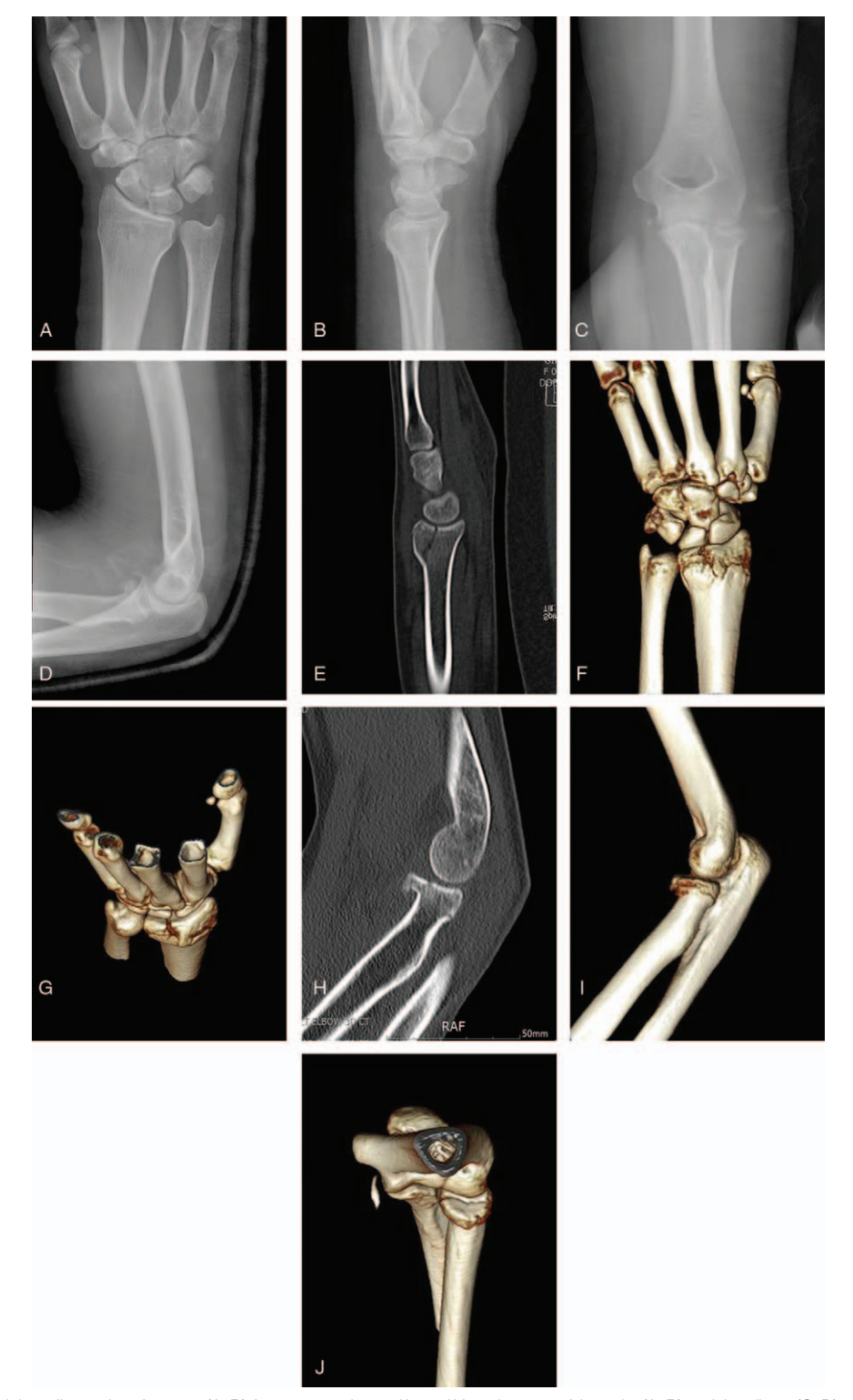
Figure 3. Preoperative plain radiographs of case 2. (A, B) Anteroposterior and lateral X-ray images of the wrist (A, B) and the elbow (C, D) and CT images of the wrist (E-G) and the elbow (H-J) show an AO B2 undisplaced distal radius fracture and Mason type III radial head fracture.

An ORIF with 2.4 mm LCP plates was performed for the radial head fracture (Fig. 4). Postoperative immobilization was performed with an above-elbow splint for 3 weeks, after which a wrist brace was applied until postoperative 4 weeks. Elbow motion was allowed after postoperative 3 weeks, and wrist motion was allowed after postoperative 4 weeks. The bony union of the distal