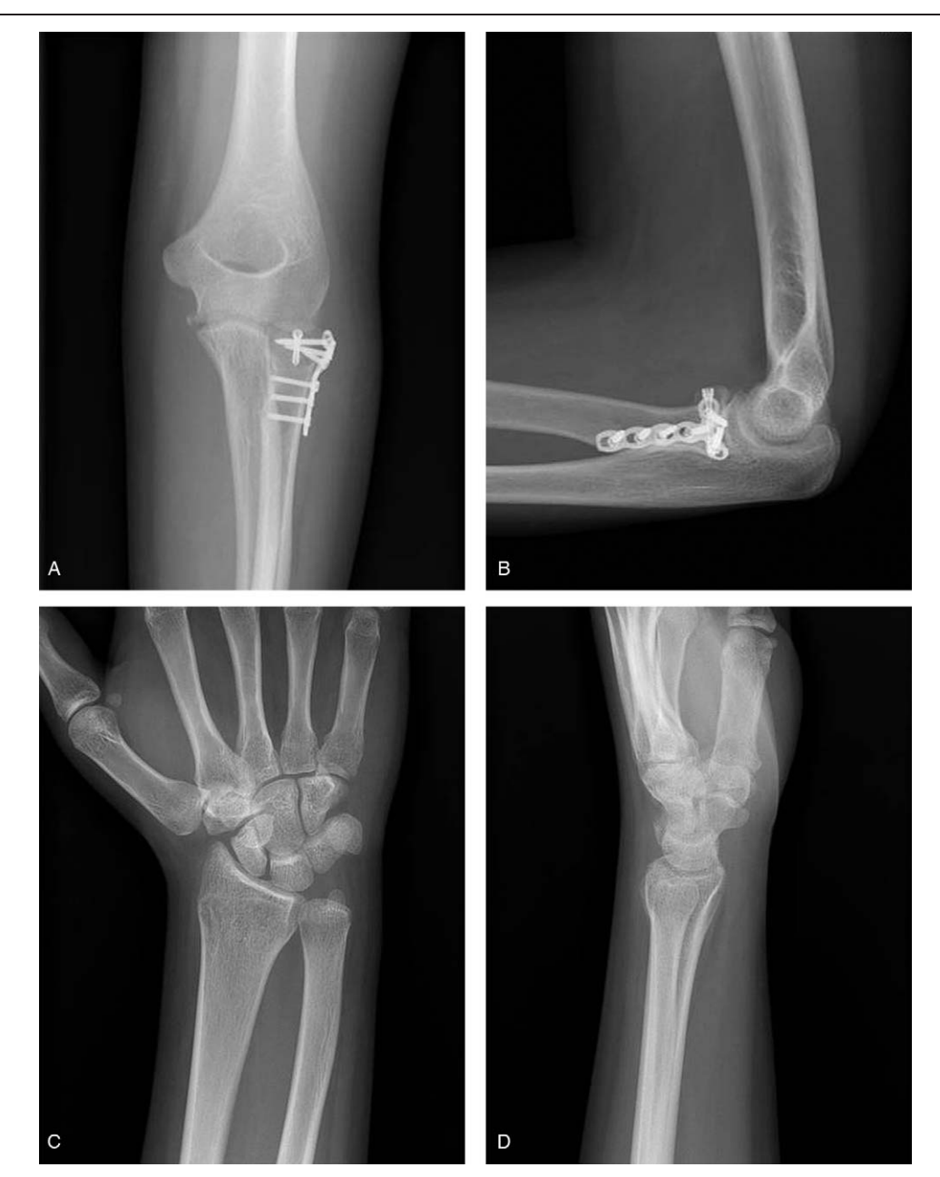
Figure 4. Postoperative plain radiographs of the elbow (A, B) of case 2 show that open reduction and internal fixation was performed for radial head fracture. Distal radius fracture was treated conservatively and the final plain radiographs show good bony union (C, D).