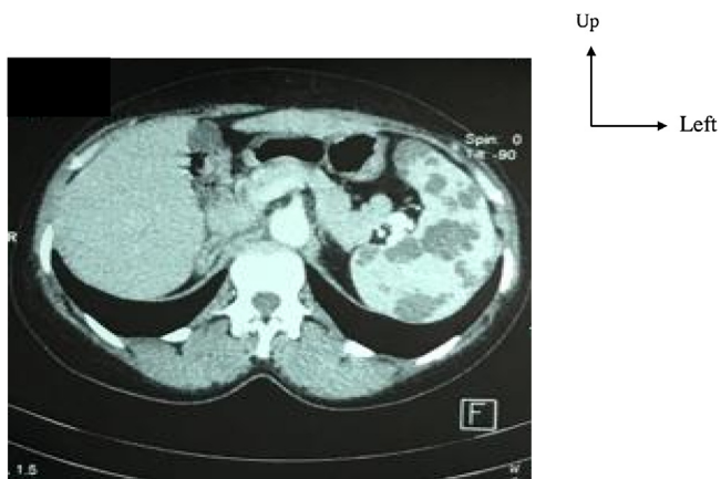
Picture 1. Abdominal CT scan showed multiples cystic lesions hypodense without enhancement. The spleen size is normal.

and necessary in pre-natal diagnosis [15]. Ultrasound describes a hypochoic splenic lesion with multiples septa and calcifications, not vascularized to Doppler [16,17]. The CT scan is radiating with more details on size of the spleen and the effects on the other organs [16]. The lesion at the CT scan is hypodense, homogeneous, with thin partitions and without intravenous contrast enhancement [17]. Partitions can be raised by the contrast if they are thick [18]. Magnetic resonance imaging has the same sensibility than the CT scan. Ultrasound and CT scan are the best imaging for the therapeutic strategy [19].