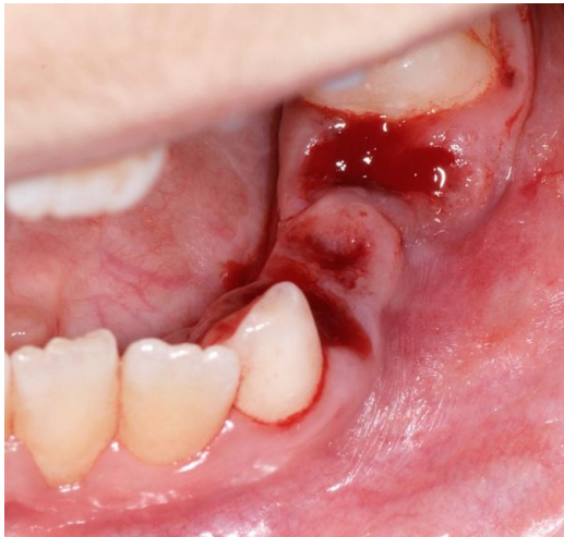
Fig 5. Perioperative photograph. The teeth sockets 74 and 75 after elevation and flooded with TA.