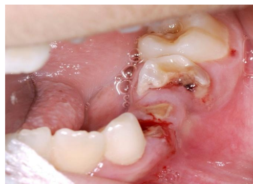
Fig 3. Preoperative photograph. Teeth number 74 and 75 are completely destroyed.

The most noticeable aspect was the severe thrombocytopenia (5,000/ \mu L). A mild hypersensitivity reaction after platelet transfusion in the past was recorded in her file.