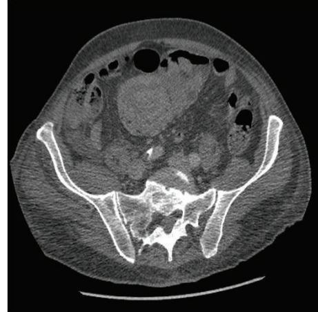
FIGURE 1: CT scan illustrating the area of intussusception.

Intussusception is rarely considered clinically in the differential diagnosis of adult patients with vague abdominal complaints. Therefore diagnosis is usually made on CT or during exploratory laparoscopy/laparotomy [8]. The clinical importance of intussusception in adults is that it is usually due to an underlying pathology. Therefore, surgical resection, with adequate margins in case of suspected malignancy, is considered as the definitive management in this population [2, 3, 9]. Although rare, intussusception is a recognised presenting feature of lymphoma [2, 5–7, 9]. The most common recognised site is the ileocolic region [2, 5–9]. We report a case of non-Hodgkin's B-cell lymphoma presenting with 2 areas of jejunojejunal intussusception. This is the first case with more than one area of small intestinal intussusception due to lymphoma in the published literature, with