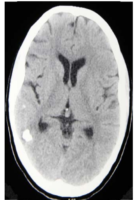
Figure 2. Axial computed tomography brain imaging showed areas of right parietal lobe hyperdensities consistent with calcification and mild cerebral atrophy of the right cerebral hemisphere as evidenced by prominence of the cerebral and Sylvian fissures.