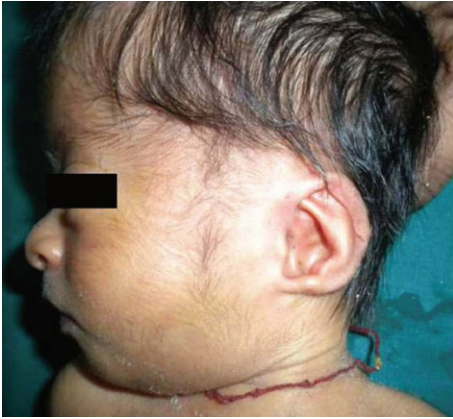
FIGURE 1: The photograph shows the facial features with downslanting palpebral fissure, large and low-set ears with preauricular pit, and micrognathia.