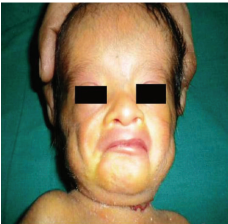
FIGURE 2: The photograph shows the facial features with prominent forehead, widely separated eyes with downslanting palpebral fissure, and micrognathia.

for his parents was performed. The mother was found to be a balanced carrier; 46,XX,t(11;22)(q23.3;q11.2) (Figure 4). During the followup examination for 3 years, he was found to have a significant central hypotonia and developmental delay, and all growth parameters remained well below the third percentile. On followup examinations, he showed developmental delay, and all growth parameters remained well below the third percentile at six months of age.