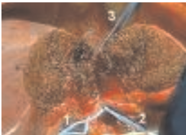
Figure 3 - Anterior approach to the liver for resection of the paracaval portion of the caudate lobe. Isolation of the portal pedicle (1, 2) and supra-hepatic inferior vena cava (3)

direct view, facilitating control of venous bleeding and the interruption of the ascending paracaval portal branches along the hilar plate (Figures 2 and 3).