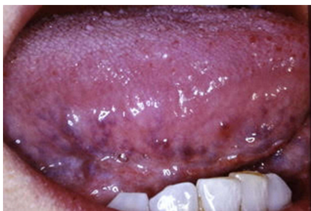
Figure 3 Medium/severe sublingual varices (grade 1). Written consent obtained from patient.

independent variables (hypertension, systolic blood pressure, DM-2, fP-glucose, dyslipidemia, fP-cholesterol, fP-HDL, waist circumference, waist-hip ratio) multiple logistic regression was performed using the enter method where the estimated values were adjusted for sex and age (Model 1) or for sex, age and smoking (Model 2).