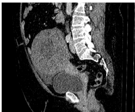
Fig. 1. Computed Tomography scan of the pelvic mass.

A central line was placed using ultrasonography using the Seldinger