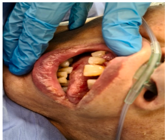
Fig. 4. Fragile and unstable teeth associated with a macroglossia.

technique the day before the surgery in the right internal jugular vein. The control of correct positioning was performed with carotid ultrasound and with X-ray of the chest.