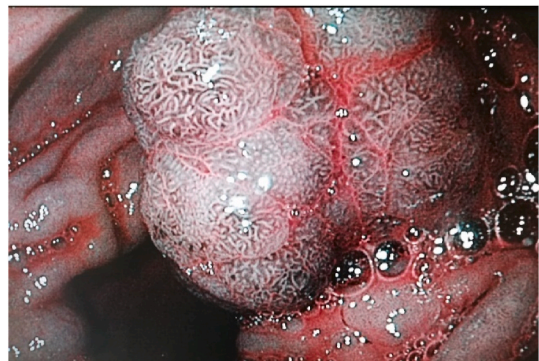
Fig. 3. Upper endoscopy showing a pedunculated polyp of the gastric antrum.