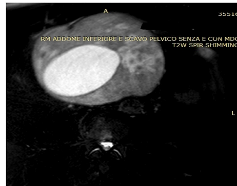
Fig. 2. A Pelvic Mass on a T2 weighted MRI at the level of L1 vertebra.