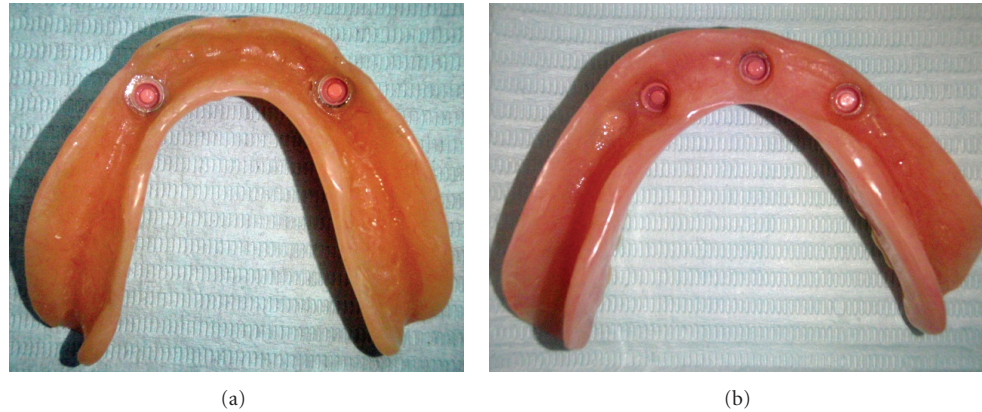
FIGURE 3: Finished mandibular overdentures with pink replacement males immediately before insertion.

the follow-up radiographs. The initial postoperative radiographs immediately after insertion of the final overdentures (baseline radiography) were compared with the follow-up radiographs after 6, 12, and 24 months of functional loading. The vertical bone loss was calculated by subtracting the bone heights in the baseline radiographs from those of follow-up radiographs. Data were collected blindly by one experienced observer throughout the entire study.