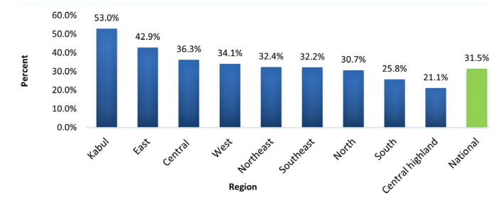
Figure 1 Seroprevalence of SARS-CoV-2 antibodies (including all positive results: IgG-positive, IgM-positive or both) among all age groups by region in Afghanistan.

This seroepidemiological study has provided estimates of the prevalence of SARS-CoV-2 antibodies across Afghanistan, in urban and rural areas, and in the nine regions of the country. Of the 360 clusters identified for participation in the study, 338 (94%) were included; the remainder were excluded due to insecure or inaccessible EAs and time constraints. Similarly, of the total planned 5408 households in 338 clusters, 5177 (96%) households completed the survey. A total of 9514 household members from these 338 clusters were interviewed and