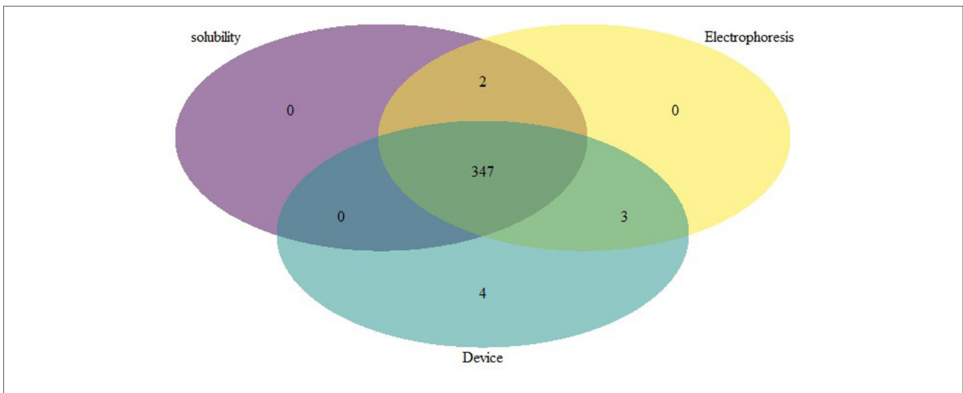
FIGURE 3 | Venn diagram depicting the comparative performance of different sickle diagnostic tests. The overlap result of diagnostic test showed that 347 samples with HbS were found to be positive in all 3 different tests.