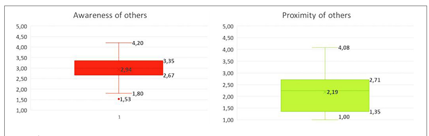
FIGURE 3 | Distribution of mean scores for social presence sub dimensions "awareness of others" and "proximity of others" (N = 41). All items were scored on a 5-point Likert scale (1 = totally disagree, 5 = totally agree).

Visiting conferences (which contributed to social presence ) had also proved valuable for students and was something they wanted to continue doing in the remainder of their study and after their study for the benefit of their network: