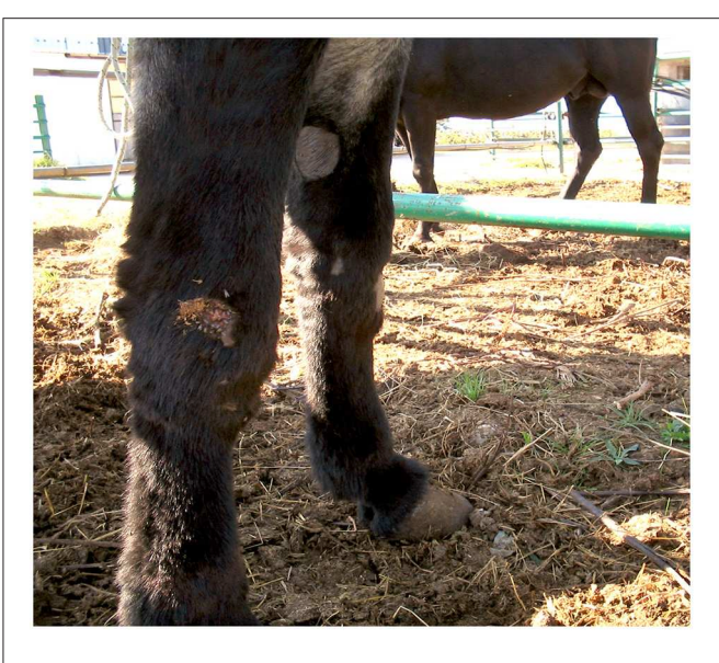
FIGURE 1 | Cutaneous habronemosis in a donkey (original, D. Traversa).

ulcers and postprandial colics (44, 45). Adults of D. megastoma create large swellings, which may hamper the peristalsis of the stomach, or impede the pyloric opening. This nematode occasionally causes acute hemorrhages or damage of the stomach wall leading to acute peritonitis and even death (46, 47). There are often congested and hemorrhagic ulcer-like areas, which can be isolated or confluent, especially when H. microstoma is present. D. megastoma causes granulomatous lesions with central necrosis, cellular debris and eosinophilic infiltration. When H. microstoma and/or H. muscae is present, an abundant secretion envelops the parasites. A close agreement between the number of infected horses by D. megastoma and the presence of lesions have been also noticed (19).