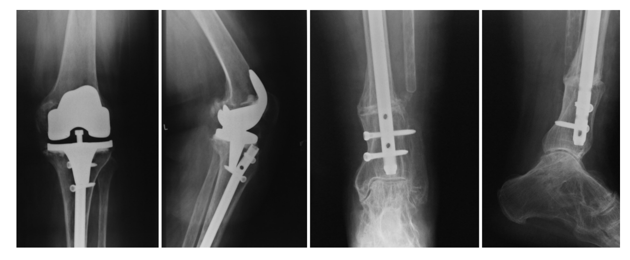
Fig. 3. 8-year follow-up radiographs of the knee and ankle joint of patient number 1.

wheelchair-dependent. The knee and function scores, according to the Knee Society clinical rating system, were 0 and -20 points, respectively.