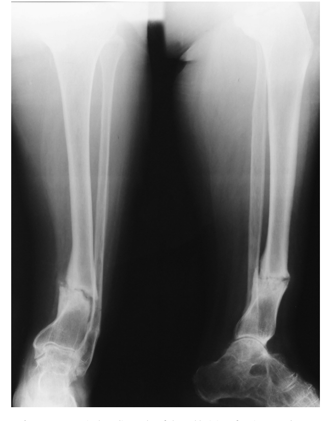
Fig. 2. Preoperatively radiographs of the ankle joint of patient number 1.

Eight years after surgery, the patient was assessed clinically and radiologically (Fig. 3). She had full ROM of her knee of 0^{\circ}-120^{\circ} without pain. The knee score and function scores, according to the Knee Society clinical rating system, were 68 and 60 points, respectively.