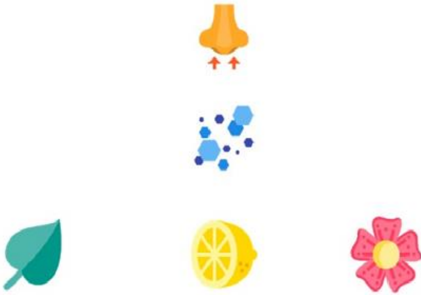
Figure 2: olfactory training consists of sniffing items with high density molecules such as roses, lemons, cloves, or eucalyptus for 20 seconds each, twice a day for \geq 3 months; patients who have an altered sense of smell due to COVID-19 infection have shown benefit through the use of this regimen