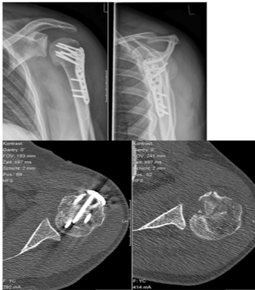
Fig. 3 Post-operative x-ray and CT scan showing the restoration of spherical shape compared to pre-operative situation

problems during activities of daily living. Unfortunately, we are not able to report about the long-term result as the patient died of complications due to his glioblastoma 22 months after surgical intervention. However, especially in this situation it was important that the patient has a long time of remaining life quality with a limited surgical trauma. Hence we applied this new technology, since it combines good reduction with a very limited surgical trauma and allows the patient immediate movement and physiotherapy.