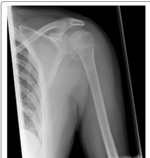
Fig. 1 Pre-operative x-ray showing the posterior dislocation and the reverse Hill-Sachs lesion

The patient recovered well from this surgical intervention, achieved a free range of motion and had no re-dislocation at the one year follow-up. No technique-related complications occurred. Unfortunately, we are not able to report about the long-term follow-up as the patient died of complications caused by his glioblastoma 22 months after surgical intervention.