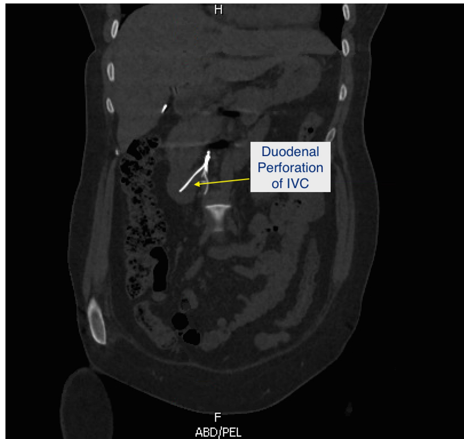
FIGURE 1: CT scan showing IVC filter penetration into duodenum.

CT: computed tomography; IVC: inferior vena cava.