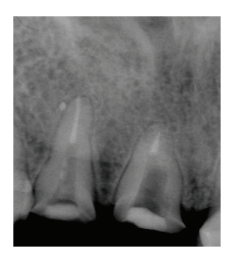
FIGURE 2: The post space should be dressed between appointments and irrigated before post cementation.

Temporary fillings, in teeth undergoing root canal treatment or before completion of the final restoration, must provide an effective barrier against salivary contamination of the root canal. Intermediate Restorative Material (IRM), Cavit, and TERM are commonly used as temporary filling materials [20]. IRM, that is used due to its high compressive strength [21], has been demonstrated in bacterial leakage to be less leak proof than Cavit and TERM [20, 22]. These results were similar to those reported by others, in experiments