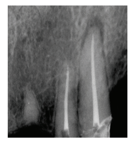
FIGURE 1: Bacterial contamination occurred after completion of root canal treatment in the tooth, which remained with a temporary filling for 15 month.

after 22 days of exposure to saliva. Both lateral and vertical condensations methods of obturation were evaluated in this study [11]. Additionally leakage of obligate anaerobes and bacterial metabolites along laterally condensed root canals was demonstrated without any significant differences between root canals obturated with gutta-perch cones (GP) and other root canal sealers [12–14].