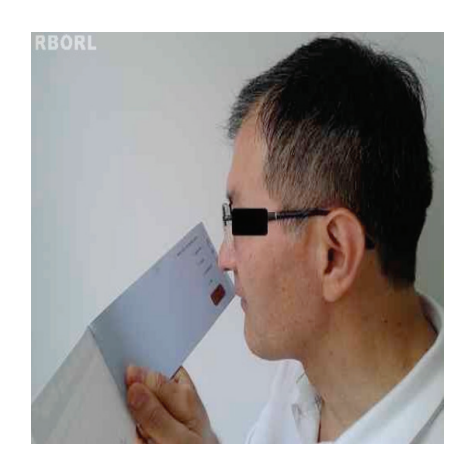
Figure 1 Male patient undergoing smell identification test (SIT) with booklet positioned at 1 cm from the nose.

was created by Doty et al.<sup>7</sup> in 1984 and recently adapted for the Brazilian population by Fornazieri et al.<sup>8,9</sup> This is an easy-to-use method with adequate reliability, suitable for outpatient use.