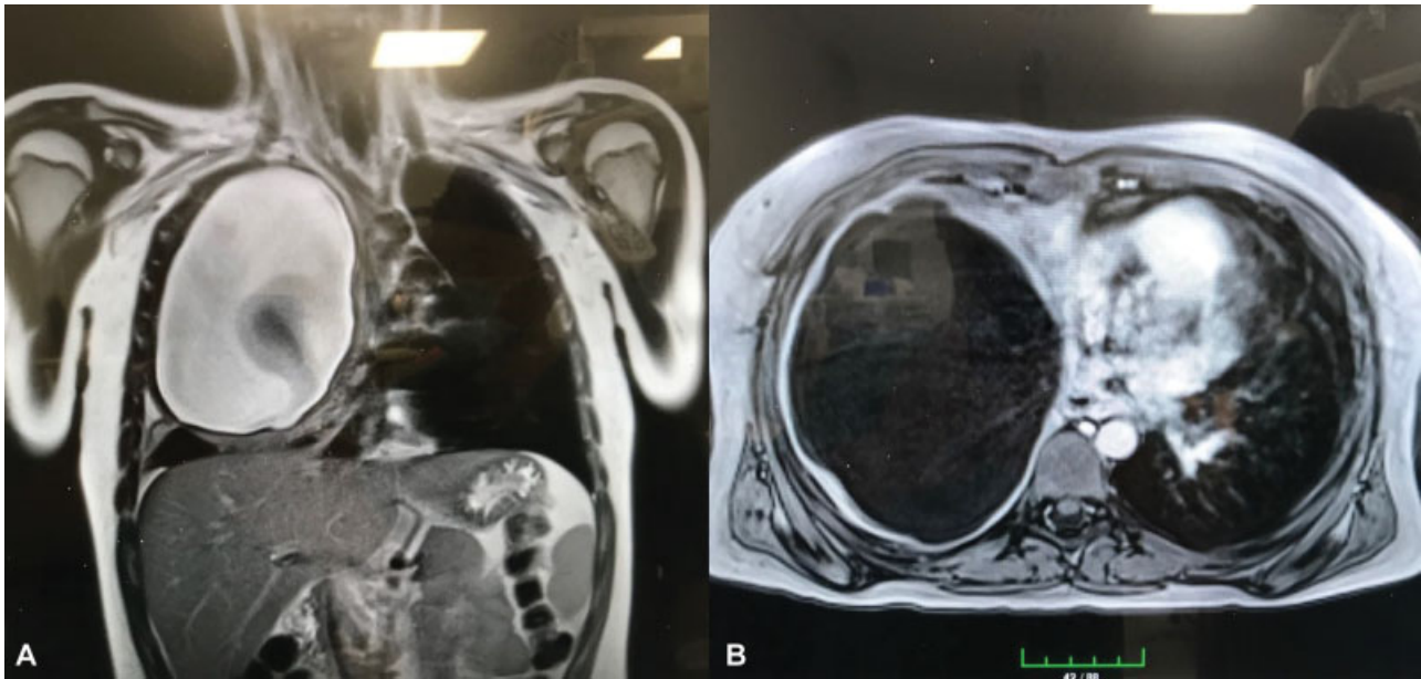
Fig. 1 Magnetic resonance images of cystic lesion located in the right hemithorax, (A) coronal and (B) axial section. The germinative membrane is seen in the cyst fluid.