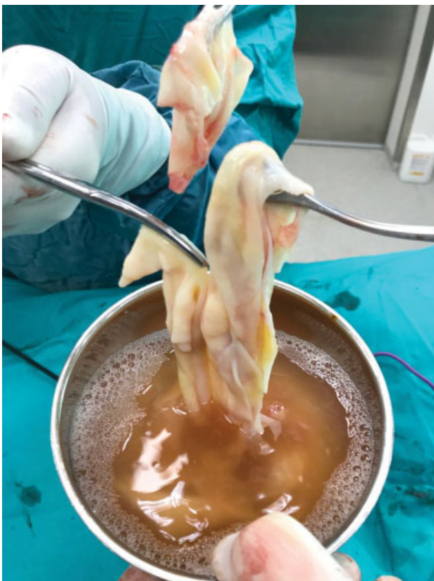
Fig. 2 The germinative membrane of the giant cyst.