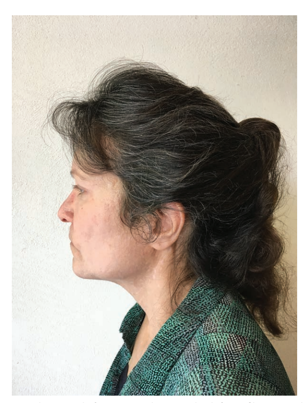
Fig. 8. Photograph from 2018 showing the left profile 8 months postoperatively and after 8 prior maintenance surgeries.