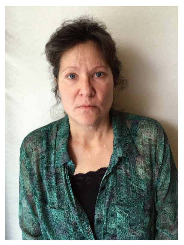
Fig. 7. Photograph from 2018 showing the right profile 1 month postoperatively and after 8 prior maintenance surgeries.