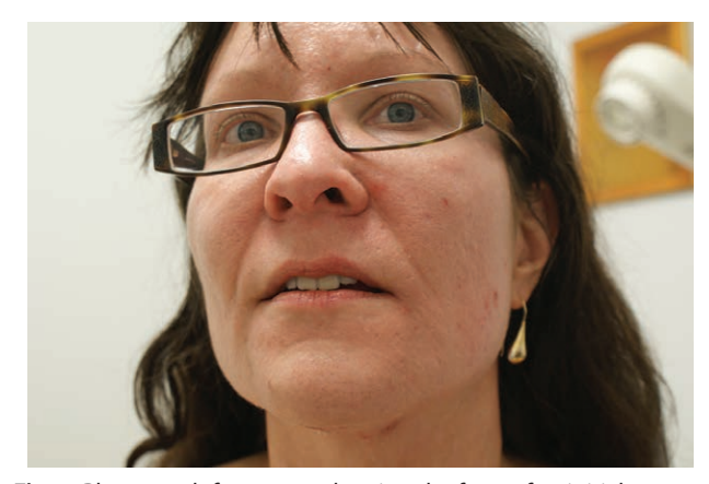
Fig. 3. Photograph from 2012 showing the front after initial surgery and 2 yearly maintenance surgeries.

Some NF1 patients may lack health insurance, while those who have had the HQ procedure frequently have insurance through employment. Some cases are funded by