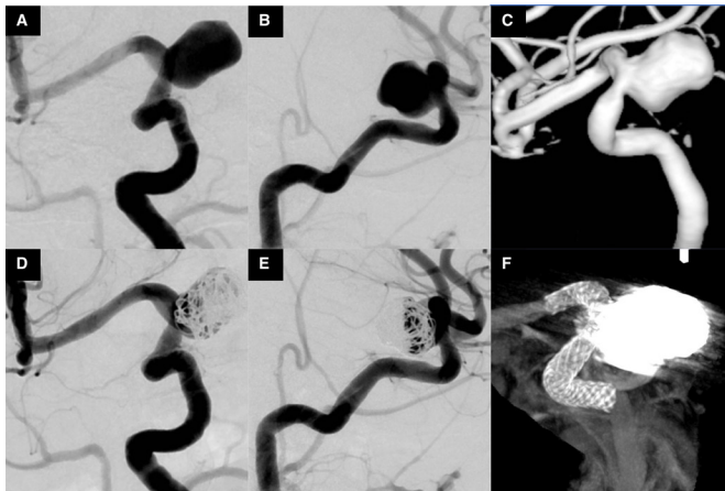
Figure 1 (A,B) Right carotid angiogram and (C) three-dimensional reconstruction demonstrating unruptured large aneurysm at the C2 portion. (D, E) Immediate postoperative angiography and (F) cone-beam computed tomography (CT) showing Pipeline embolization device across the internal carotid artery and coil insertion.

Cerebral angiography was performed 7, 9, and 14 months after thrombectomy (figure 3C–E). Fourteen months later, progression of ISS was confirmed to be suppressed. Oral administration of steroids and antihistamines was completed, and close observation has been continued.