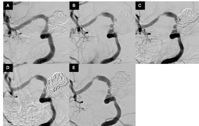
Figure 3 Right carotid angiography after thrombectomy. (A) At 1-week follow-up, (B) at 6-months' follow-up, (C) at 7-months' follow-up, (D) at 9-months' follow-up, and (E) at 14-months' follow-up.

cobalt in the PED. After administration of oral steroids and antihistamines, progression of ISS was suppressed, and no other findings suggested causative disease. Thus, we considered that delayed parent artery occlusion and ISS recurrence were associated with cobalt allergy. As there is no report of cobalt allergy with PED placement and no evidence for long-term outcomes for medical treatment of DTR to metal device implantation, close clinical and angiographic monitoring are warranted.