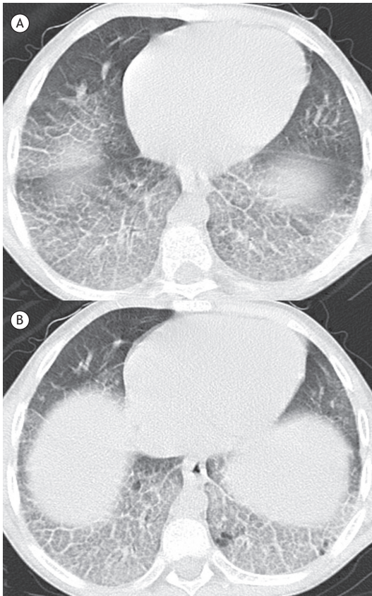
Figure 2. Sixteen-year-old male patient. Chest HRCT slices (lung window) from the lower lung zones. Note smooth interlobular septal thickening in both lungs (predominantly in the lower lobes), intralobular lines, and ground-glass opacities with a crazy-paving pattern.