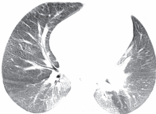
Figure 3. Fourteen-year-old female patient. HRCT scan of the chest. Note ground-glass opacities predominantly in the lower lobes, interspersed with areas of air trapping in the left lower lobe.

to data found in the literature. With regard to age at diagnosis, studies have shown that NPD type B has been reported in patients in different age groups, although it is most commonly observed in those less than 20 years of age. (12) It is difficult to determine with precision the age group predominantly affected by NPD type B; however, the mean age at symptom