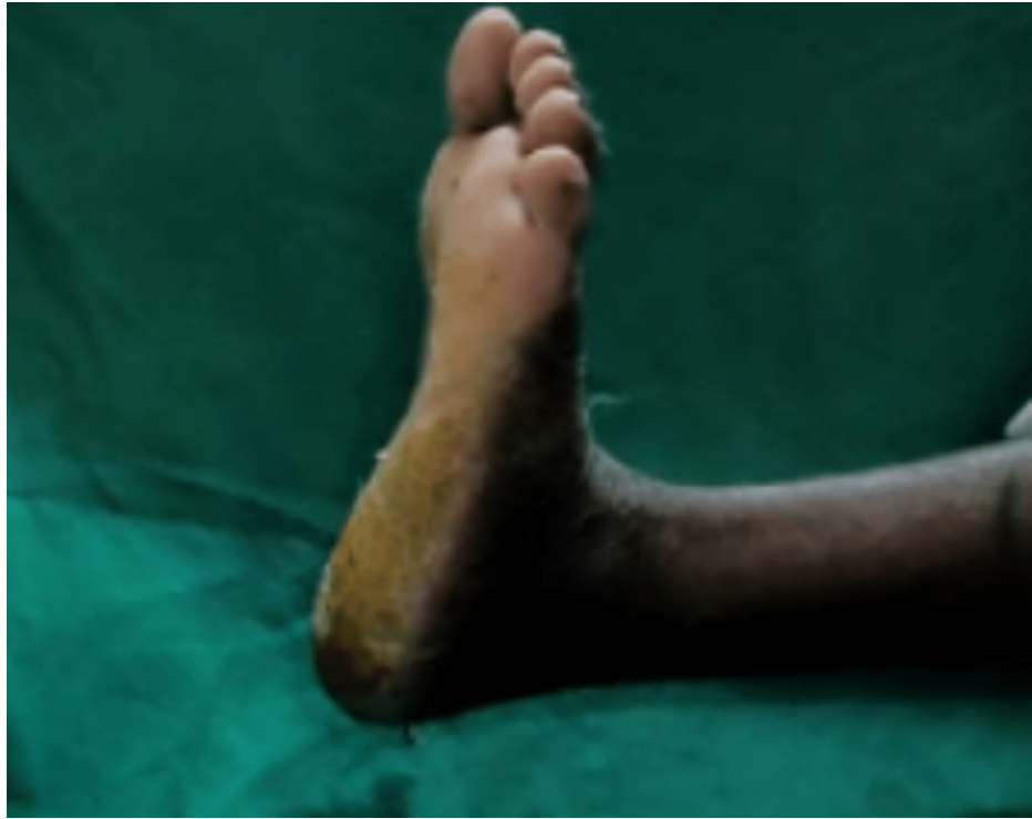
FIGURE 8: Post-operative dorsiflexion

The patient was started on gentle ankle range-of-movement exercises and he was given a heel raise of 6 cm on the left side and was advised to start progressive weight bearing and was advised not to squat. On the three-month follow-up, the patient regained his normal function and was able to squat without any difficulty. On the six-month follow-up, the patient was able to perform his daily activities without any difficulty and was able to do his work with full efficiency.