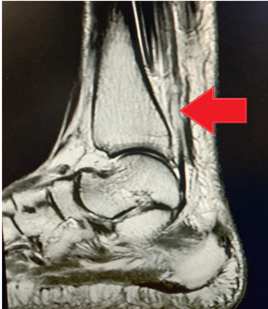
FIGURE 1: Pre-operative MRI showing large tendon defect (arrow)

Radiographic imaging showed no bony abnormality. Magnetic resonance imaging was performed and it was found that the tendo Achilles was ruptured with a defect of 4 cm and retraction of the torn end (Figure 1). Thus, the imaging findings correlated directly with the clinical examination. All the pre-operative assessments were done and the patient was planned for operation.