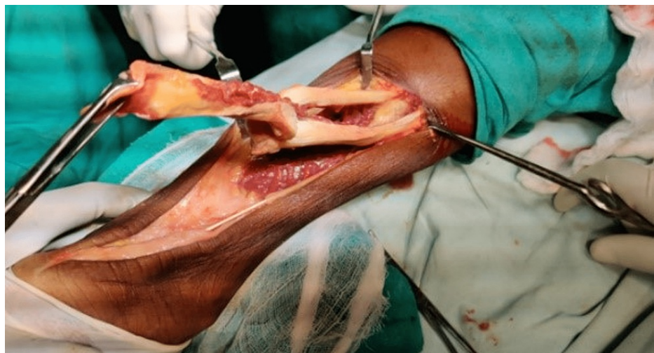
FIGURE 3: Turn-o-plasty in progress with the middle segment of the proximal tendon being reflected to complete the defect

The proximal part of the tendon was split in three and the middle portion was reflected (turn-o-plasty) and attached to the insertion site across the calcaneum after drilling through the calcaneum with a Kirschner wire (K-wire) and fixed between the lateral and medial process of the calcaneal tuberosity with the help of suture disc and Ethibond (Ethicon Inc, Raritan, New Jersey, United States) (Figure 3, Figure 4, and Figure 5).