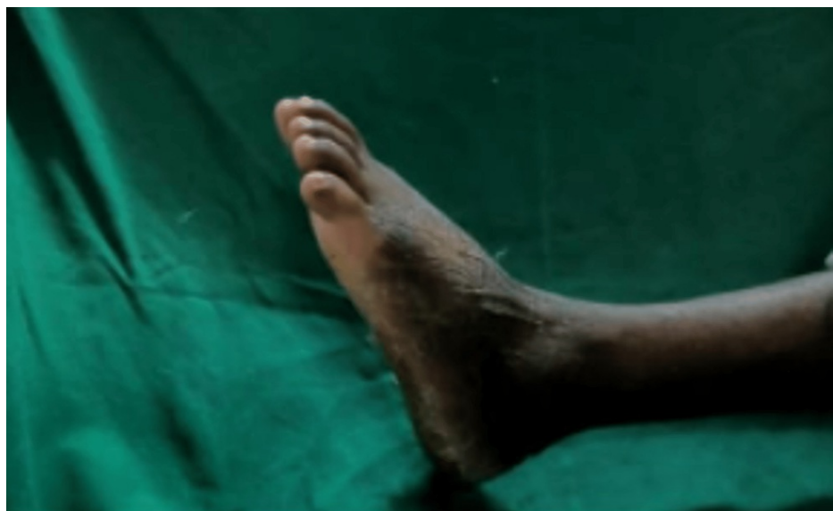
FIGURE 7: Post-operative plantar flexion

The patient was given a below-knee slab in gravity equinus position and was converted to below-knee cast on the third day after check dressing and was kept non-weight bearing for four weeks. On the one-month follow-up, the below-knee cast and suture disc were removed. Thompson's test and Matles tests were negative and the ankle range of movement on the left side was 0-10 degree dorsiflexion and 0- 15 degree plantar flexion and same as the right side (Figure 7 and Figure 8).