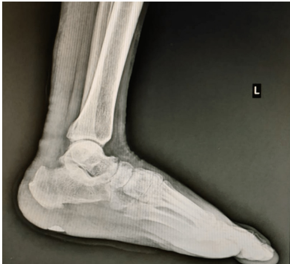
FIGURE 6: Post-operative x-ray showing suture disc

The patient was given a below-knee slab in gravity equinus position and was converted to below-knee cast on the third day after check dressing and was kept non-weight bearing for four weeks. On the one-month follow-up, the below-knee cast and suture disc were removed. Thompson's test and Matles tests were negative and the ankle range of movement on the left side was 0-10 degree dorsiflexion and 0- 15 degree plantar flexion and same as the right side (Figure 7 and Figure 8).