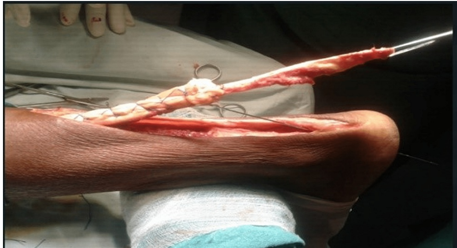
FIGURE 4: Augmentation of proximal remaining segment with Ethibond

Ethibond™ (Ethicon Inc, Raritan, New Jersey, United States)