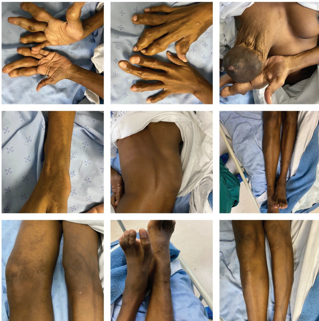
Fig. 2. Characteristic clinical features of Klippel Trenaunay Syndrome identified in the patient (from top left corner to bottom right corner): bony hypertrophy of digits; right breast (post-surgery for excision of cystic lymphangiomas, port wine stains on the right wrist, kyphoscoliosis; limb-length discrepancy; port-wine stain on inner thigh; evidence of deep vein thrombosis on the left leg.