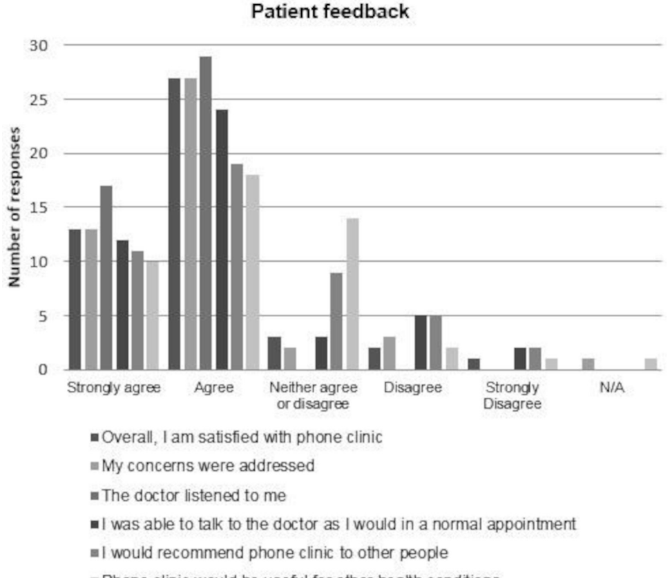
Phone clinic would be useful for other health conditions

In order to address our processing measure, we devised a definition of a successful consultation. A consultation was deemed successful if the clinician felt that the outcome of the consultation was likely to have been the