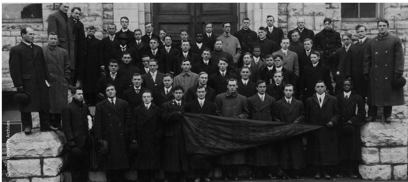
Figure 1: The graduating class of the Queen’s Faculty of Medicine on the steps of Jackson Hall in 1914. This cohort was one of the last to include Black students before the school’s ban on Black medical students in 1918.