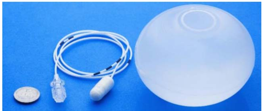
Fig. 1 The Elipse® balloon

For each endpoint, subset analysis was performed by gender and BMI ( \text{kg}/\text{m}^2 ) ( < 30 , 30 to 40 , and > 40 ).