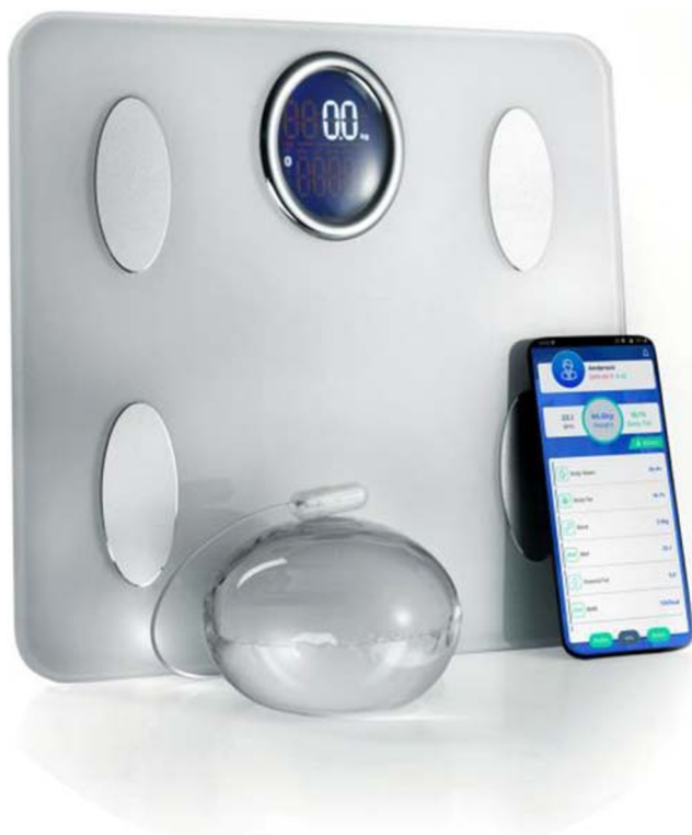
Fig. 4 The Elipse system: Elipse balloon, Bluetooth® body composition scale, and smartphone app for virtual follow-up

The Elipse balloon was placed in 1770 overweight and obese patients (F 1264/M 506) at 19 international obesity centers of excellence (Table 1). During the Elipse program, the patients were closely followed by a dedicated multidisciplinary team. The program commenced 2 weeks prior to balloon placement and continued until balloon passage at approximately 4 months. Prior to placement, a detailed medical obesity history, nutritional behavior history, and anthropometric evaluation (height, weight, BMI, circumference of waist) were performed. Laboratory values were