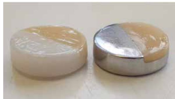
Fig. 1: Discs half-covered with Ls2 ceramic prepared to observe the features of the junction area by SEM.

A set of 12 discs of each material was used to quantify the formation of biofilm at 24 h and 48 h and for scanning electron microscopy (SEM) analysis. Additionally, 3 discs, the ones made of Ti, ZrO_2 and Co-Cr, were half covered with lithium disilicate (Ls2) glass ceramic (IPS, Ivoclar, Amherst, USA) to study specifically the junction between both materials by SEM (Fig. 1).