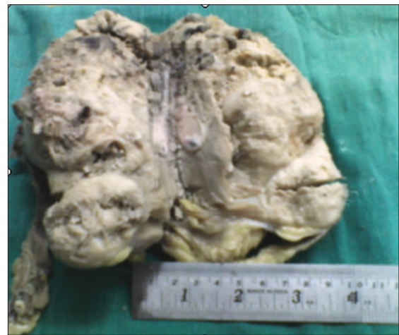
Figure 2: Gross features of PNET kidney showing grayish tumor in one pole