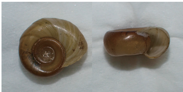
Fig. 1. Shell of Biomphalaria tenagophila from Rio de Janeiro, Brazil.

a A, acrocentric; M, metacentric; SM, submetacentric; ST, subtelocentric; T, telocentric chromosomes.