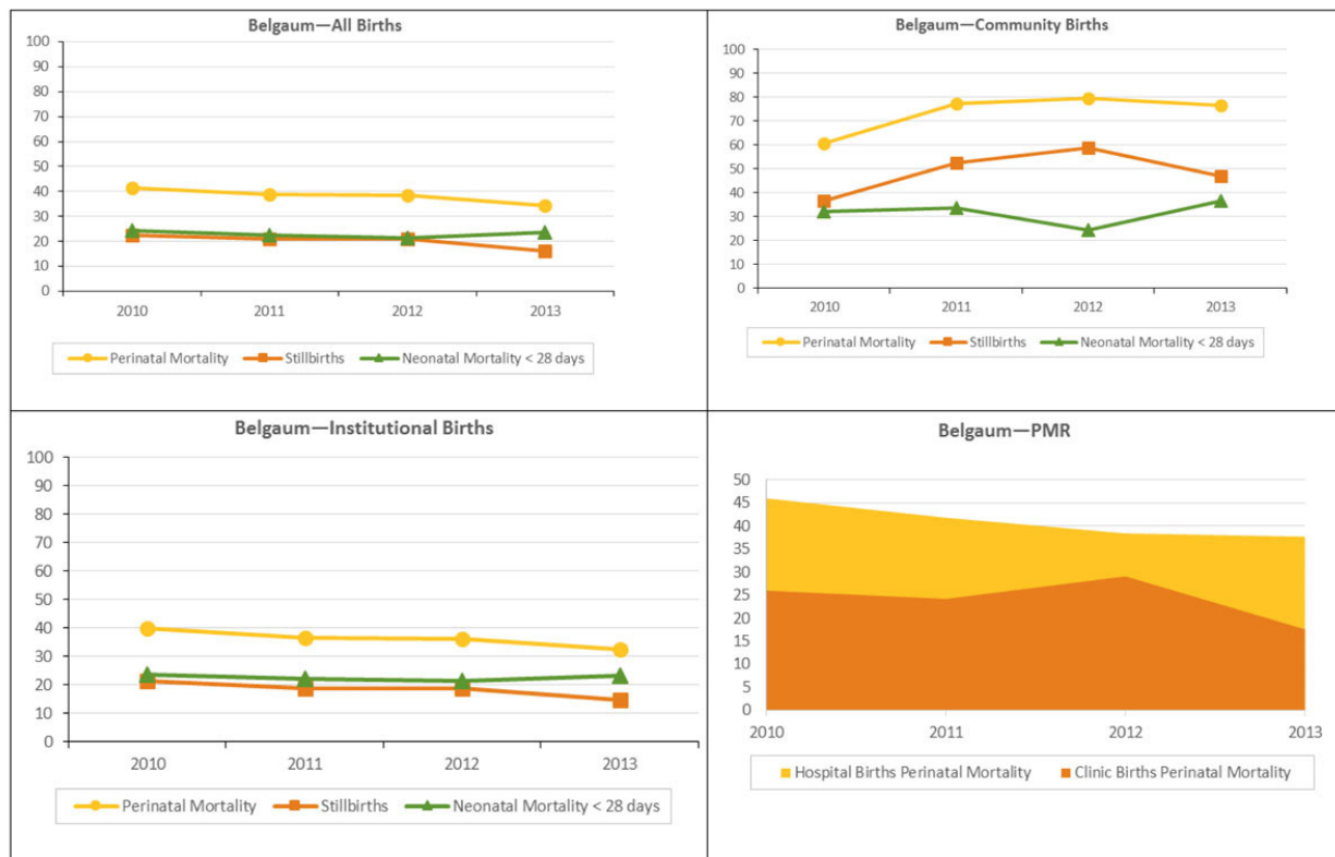
Figure 1 PMR, stillbirths and NMR <28 days: Belgaum

leading cause of death in both sites, and indicates further efforts to improve obstetric care and to provide first minute bag and mask resuscitation are needed. Yet, very early and early neonatal mortality rates rose in Nagpur, and thus there was a smaller decline in perinatal mortality in Nagpur than in Belgaum. Still, unlike the quasi-experimental comparisons of India’s Janani Suraksha Yojana conditional cash transfer program [13], virtually no improvement was observed in early or 28-day neonatal survival in either location. The decline in stillbirth but not neonatal mortality rates may be mediated by the increase in cesarean sections, responsive to fetal distress, and is consistent with observations from Bangladesh [15]. In Bangladesh, the demand side financing program was