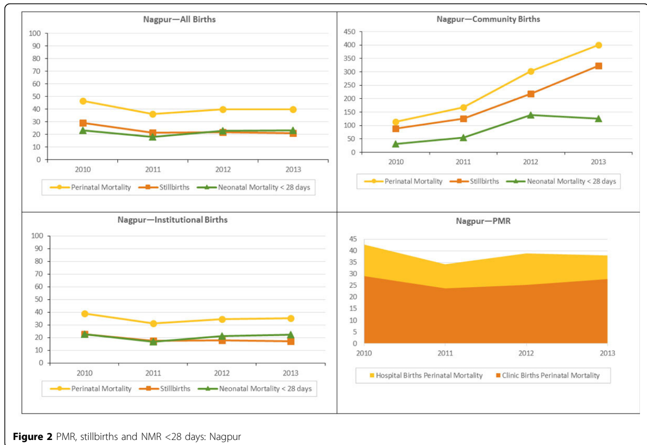
Figure 2 PMR, stillbirths and NMR <28 days: Nagpur

Global Network sites participated in also found limited influence on institutional quality of care and concluded that improving pregnancy outcomes requires more infrastructural preparedness than provider training and community mobilization alone can provide [27]. The observed reduction in stillbirth rates may also be associated with more babies receiving resuscitation. The decline in asphyxia related mortality in Belgaum supports this speculation. Even though there was a decline in bag and mask resuscitation in Belgaum, resuscitative stimulation, which is not assessed in the registry, likely increased in the area's HBB projects [19]. While the increase in cesarean section rates suggests that more women are being identified with pregnancy complications through institutional delivery, the increase in community NMR indicates the continued delivery of high risk or complicated cases in home births. Caste disparities continue to exist, with women of lower castes continuing to have higher rates of home birth [31].