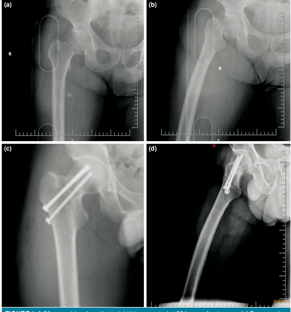
FIGURE 1. A 56-year-old male patient, right hip, operated at 22 hours after trauma. (a) Preoperative anteroposterior graphy. (b) Preoperative lateral graphy. (c) Postoperative anteroposterior graphy at six months. (d) Postoperative lateral graphy at six months.

The Harris hip evaluation score was used to evaluate the functional results of the patients. In this scoring, the degree of pain, daily activities, and range of motion are evaluated. [19] At the final follow-up examination, the Harris hip scores were assessed by an independent assessor. The assessor was blinded to