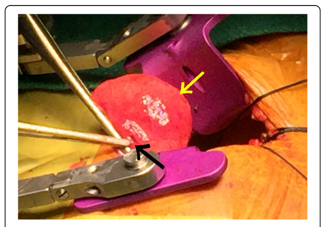
Fig. 3 An intraoperative view of the left upper lobe. An operative image showing the perforation site (black arrow) in the left upper lingular segment, with swollen lung (yellow arrow) containing a pulmonary cyst

We report a rare case of RV perforation, pneumatocele and pneumothorax after a pacemaker lead placement, requiring partial lung resection.