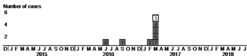
Fig. 1. Epidemic curve of tuberculosis cases in relation to a manga café outbreak, Tokyo, Japan, 2016–2017. A box indicates the timing of the development of symptoms or diagnosis (if asymptomatic) of the tuberculosis patients. The numbers in the boxes are the patients' ID numbers referred in the main text. It was later found that patient 3 had a different strain of Mycobacterium tuberculosis than that of patients 1 and 8 who were considered as source cases.