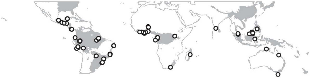
Figure 1. Sites with data used in the models of species occurrence and abundance (circles). Grey shaded areas are those defined as being tropical or sub-tropical forest according to the BIOME model [24].

to land-use and other environmental gradients may be mediated by the functional traits of species: large, slower-breeding, less-mobile species that are dietary and habitat specialists are typically more vulnerable to land-use change than other species [7–13]. The traits that confer vulnerability to land-use change vary geographically [14,15], with tropical forests containing a high proportion of species having traits likely to render them vulnerable to land-use change [13,16]. Tropical forests are predicted to experience among the greatest rates of natural vegetation loss in the near future [17].