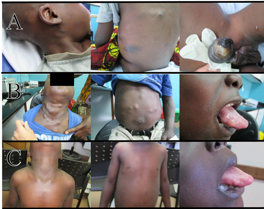
Fig. 2 Clinical images showing lesions (a) at the time of diagnosis of KS-IRIS, (b) following antineoplastic therapy, and (c) following antihelminthic therapy

cutaneous lesions. His ART was shifted to abacavir-lamivudine-lopinavir/ritonavir due to anemia (hemoglobin 7.2 g/dL) and potential activity of protease inhibitors against human herpes virus-8 [13, 14]. He was started on a chemotherapy regimen of bleomycin (15 U/m 2 ) and vincristine (1.4 mg/m 2 ) every 2 weeks. Biopsy was not obtained initially due to logistical and resource constraints.