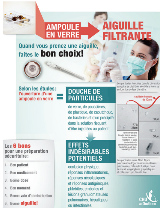
FIGURE 2: Poster for filter needles.

2.4. Evaluation of the Intervention. The sixth step of IM is the program evaluation. We used a before-after design with one group. Due to practical constraints, it was not possible to use a control group since the intervention units were not comparable to other care units in the hospital.